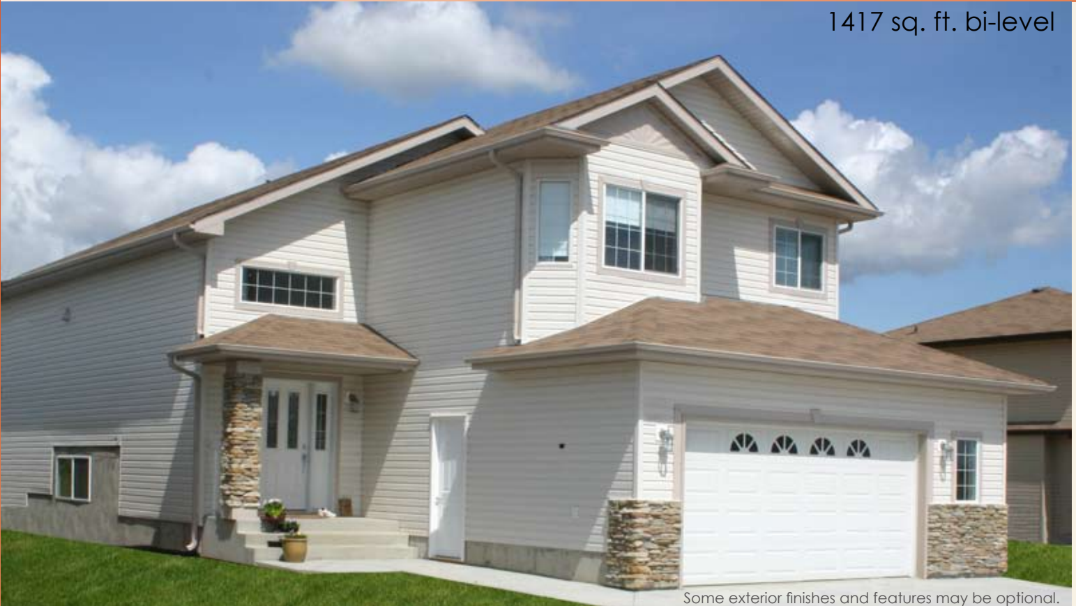
Some exterior finishes and features may be optional.