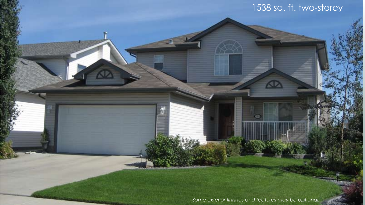
Some exterior finishes and features may be optional.