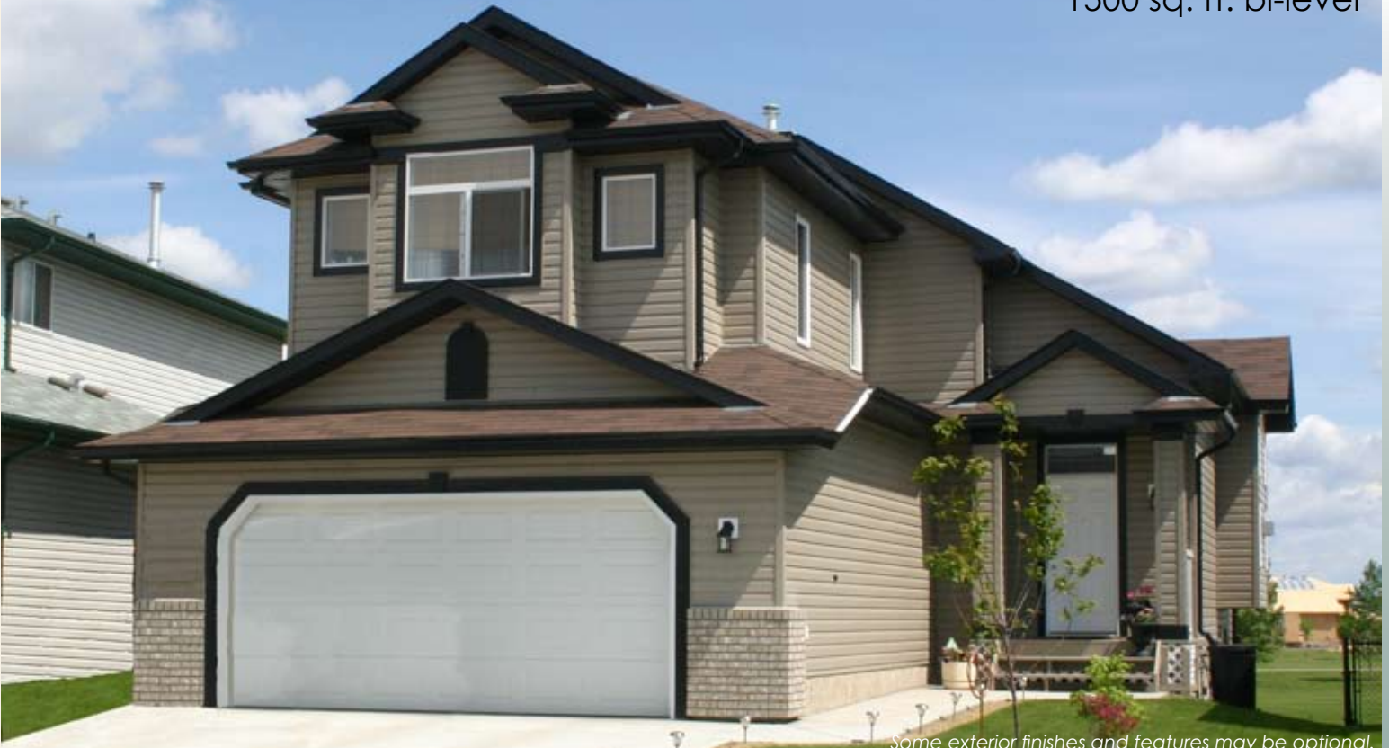
Some exterior finishes and features may be optional.