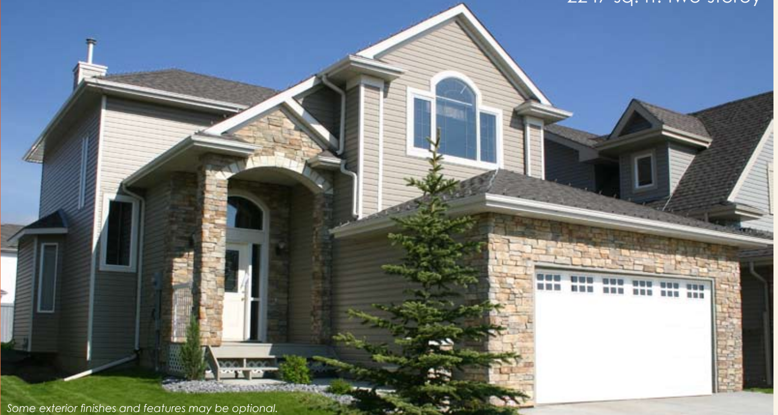
Some exterior finishes and features may be optional.