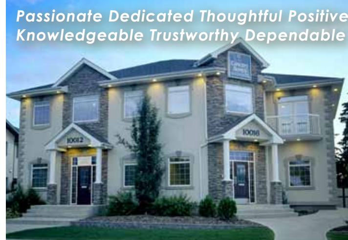
Concept® Homes Main Office building

Founded in 1969, Concept® Homes is still owned and operated by the Hinteregger family. Their sound business practices and commitment to trades, suppliers, staff and customers produce quality homes at reasonable prices. We are grateful for our community's support, and as such we sponsor local charities, build homeless housing projects and help STARS build their lottery homes. This contribution is our way of showing our appreciation for the neighbourhoods we work and live in.