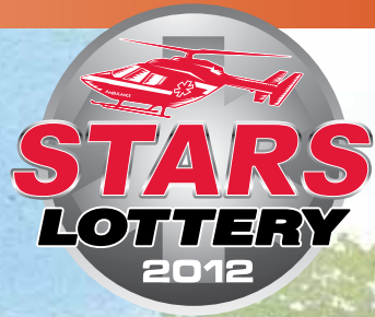
#155 Campbell Drive, Sherwood Park, Alberta