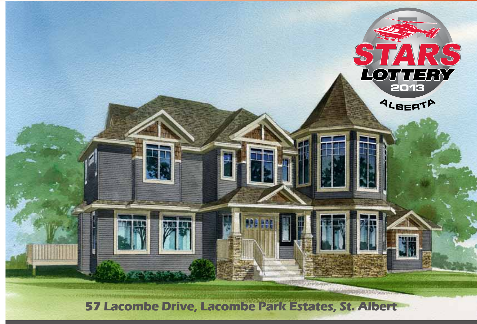
57 Lacombe Drive, Lacombe Park Estates, St. Albert