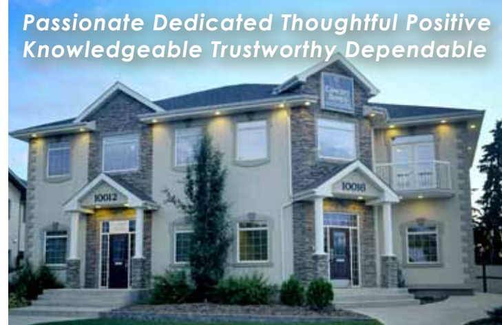
Concept® Homes Main Office building

Founded in 1969, Concept® Homes is still owned and operated by the Hinteregger family. Their sound business practices and commitment to trades, suppliers, staff and customers produce quality homes at reasonable prices. We are grateful for our community's support, and as such we sponsor local charities, build homeless housing projects and help STARS build their lottery homes. This contribution is our way of showing our appreciation for the neighbourhoods we work and live in.