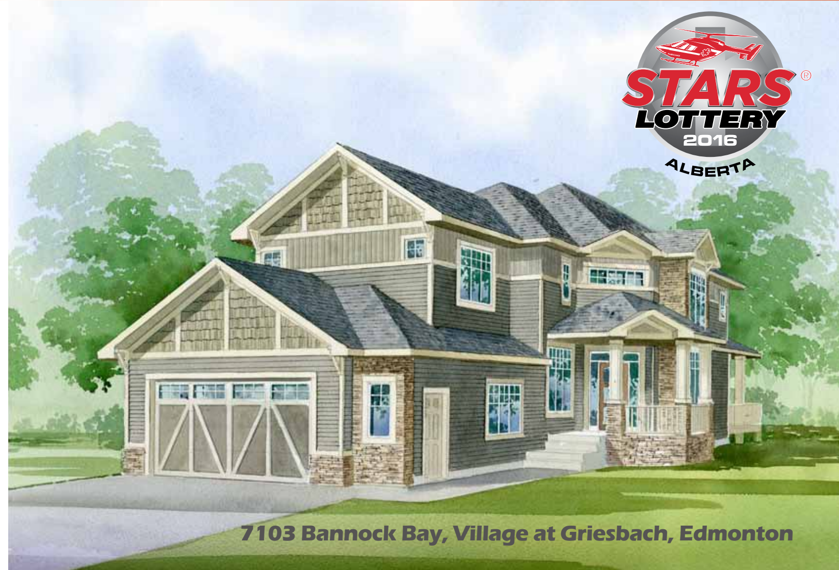
7103 Bannock Bay, Village at Griesbach, Edmonton