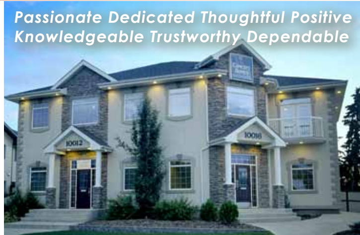
Concept® Homes Main Office building

Founded in 1969, Concept® Homes is still owned and operated by the Hinteregger family. Their sound business practices and commitment to trades, suppliers, staff and customers produce quality homes at reasonable prices. We are grateful for our community's support, and as such we sponsor local charities, build homeless housing projects and help STARS build their lottery homes. This contribution is our way of showing our appreciation for the neighbourhoods we work and live in.