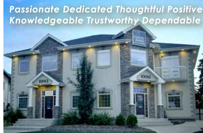
Concept® Homes Main Office building

Passionate Dedicated Thoughtful Positive Knowledgeable Trustworthy Dependable