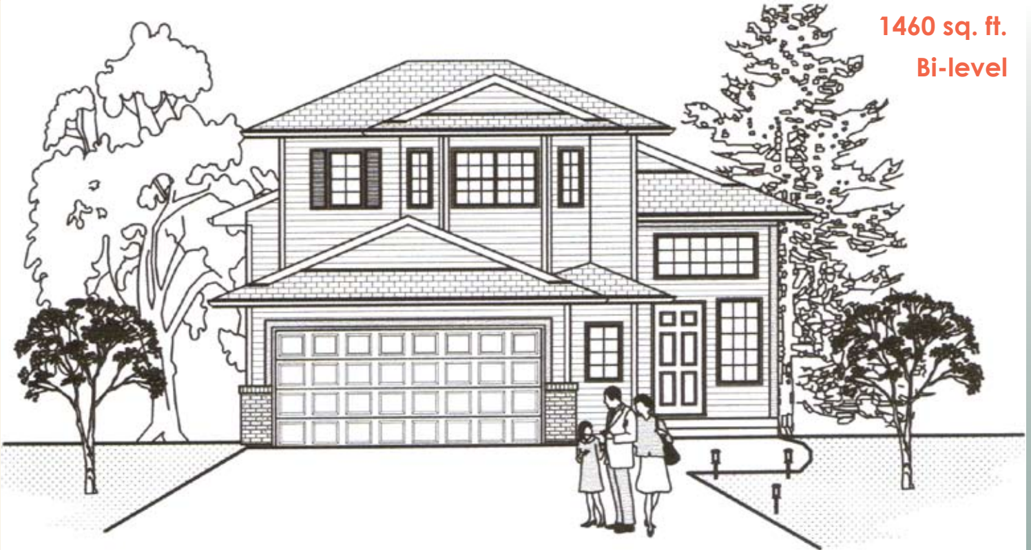
Main Floor - 1110 sq. ft.